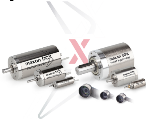
Product overview: DCX motors, GPX gearheads and ENX encoders can be configured online. © 2012 maxon motor ag